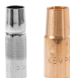
MIG/MAG gas nozzles

Gun neck carries the electrical current to the tip of the gun along with the shielding gas and cooling liquid. You can extend your welding gun lifetime by updating the neck.